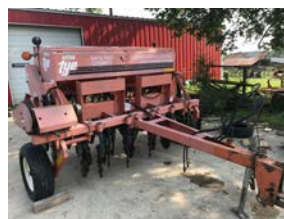
NO-TILL SEED DRILL

APPROXIMATELY 220 ACRES WERE SEEDED IN PASTURE GRASSES THIS YEAR BY RENTERS, TOTALING OVER $1,500 IN PROCEEDS